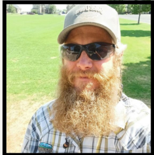
Favorite Alpine Days Activity: "The Fireworks"

Legacy Park sprinkler upgrade to water smart system Healey Park playground area Creekside pickleball courts Roundabout cleanup and revamp Maintaining cemetery and all city parks sprinklers