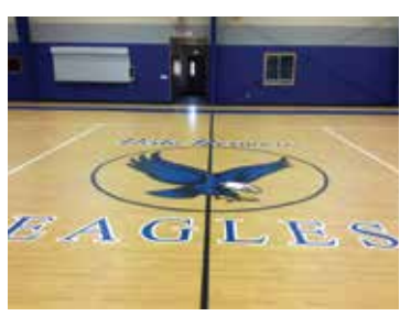
Suitable for many activities including basketball, volleyball and dance.