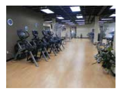
A true hybrid system with desirable shock absorbing characteristics.

Connor Sports • 800.283.9522 • 847.290.9020 • info@connorsports.com • connorsports.com/resilient