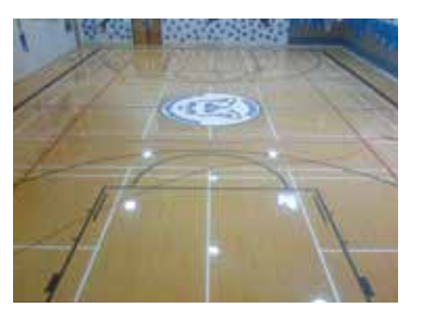
ElastiWood meets rigorous DIN and EN performance standards and criteria. and uniform performance.