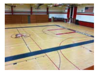
Creates the look of hardwood, without the need for costly annual refinishing.