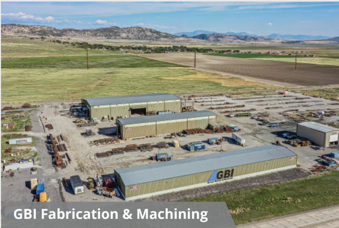
GBI Fabrication & Machining

GBI's experienced craftsmen have been building America with EPIC Safety & Quality since 2007. We deliver a single source for steel fabrication, machining and paint needs from our facility in Plymouth, Utah. GBI's disciplined project management and communications help ensure your project is completed on-time and on budget.